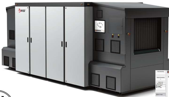
MV3D Universal Viewing Station